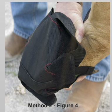
Method 2 - Figure 4

METHOD 2 - Pick up the hoof and position the hoof on the center of the pad. Gather the bandage around the hoof without securing "the tabs" (Figure 5). Place the hoof and bandage on the ground and move to Step 3.