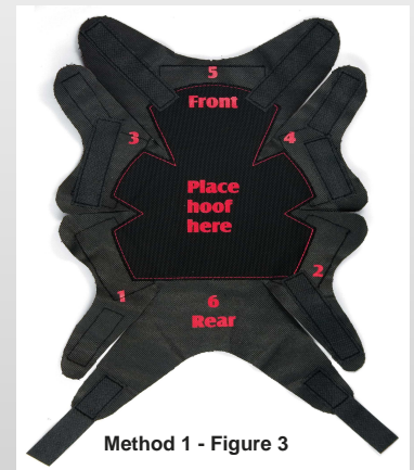
Method 1 - Figure 3

METHOD 1 - Lay bandage flat on the ground. Place hoof on the center of the bandage (Figure 3). You are now ready for Step 3.