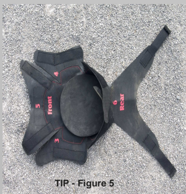
TIP - Figure 5

TIP - Pre-attach the rear tabs 1 and 2 (Figure 6) so they form a "cup". Pick up the hoof and place the "cup" on the rear of the hoof and make sure it is positioned in the center of the bandage. Place the hoof and wrap on the ground.